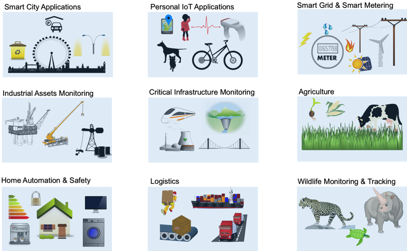
Fig. 1. Applications of LPWA technologies across different sectors